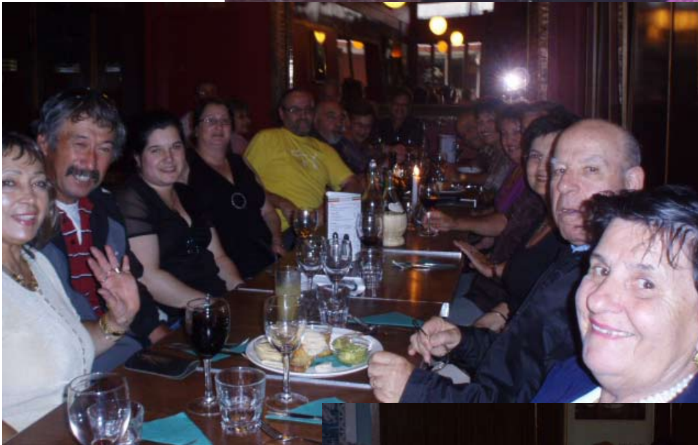
Dinner at La Casa Pasta with the Maltese from the Gold Coast.