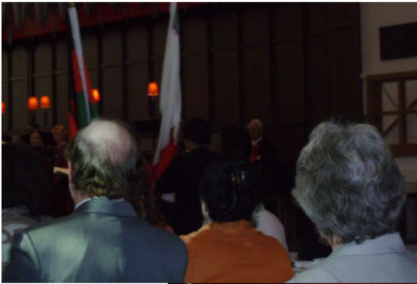
Commonwealth day at St.Paul's Cathedral in Wellington